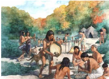
Group of hunters and gatherers.

1. One of the most fascinating places on the planet is the Nile River in Egypt. The Nile flows thousands of miles up the continent of Africa, emptying into the Mediterranean Sea. Without the Nile River, Egypt would be more like the moon! The Nile River brings life to this arid region. It has helped nourish many civilizations throughout the past 5,000 years.